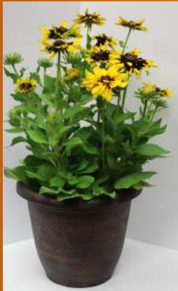
10" Fall Festive Rudbeckia