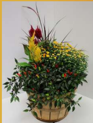
Bushel of Color Combo