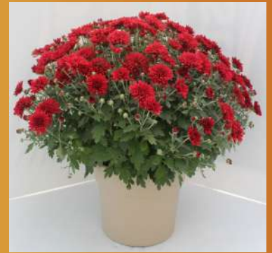
10" Garden Mum