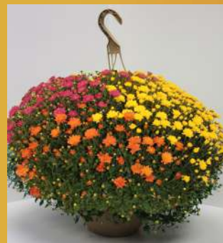
12" Garden Mum Tricolor Hanging Basket