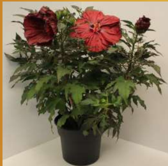
10" Hibiscus Perennial