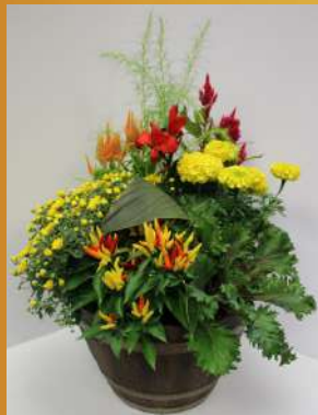
Whiskey Barrel Combo