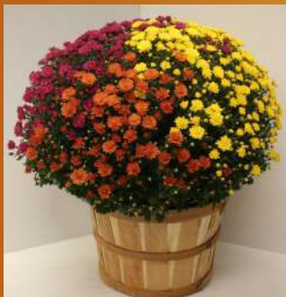
14" Tricolor Bushel Mum